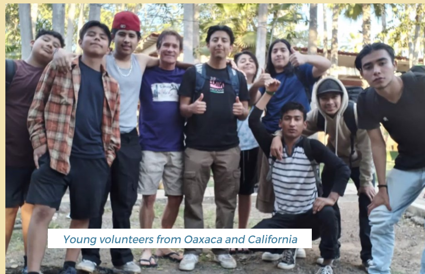
Young volunteers from Oaxaca and California