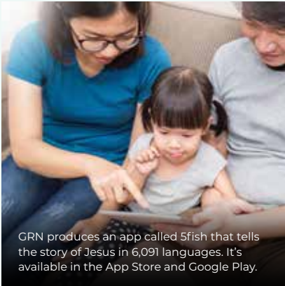
GRN produces an app called 5fish that tells the story of Jesus in 6,091 languages. It's available in the App Store and Google Play.

GLOBAL RECORDINGS NETWORK USA RECRUITER/STUDENT MOBILIZATION