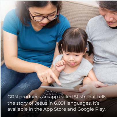
GRN produces an app called 5fish that tells the story of Jesus in 6,091 languages. It's available in the App Store and Google Play.

GLOBAL RECORDINGS NETWORK USA RECRUITER/STUDENT MOBILIZATION